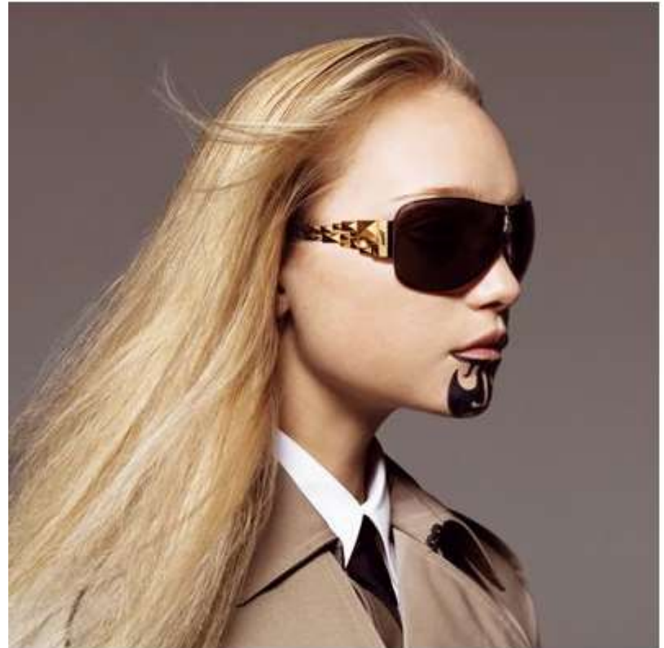
Advertisement published in Vogue