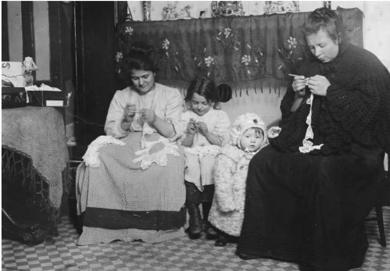
Lace workers, New York City, 1911