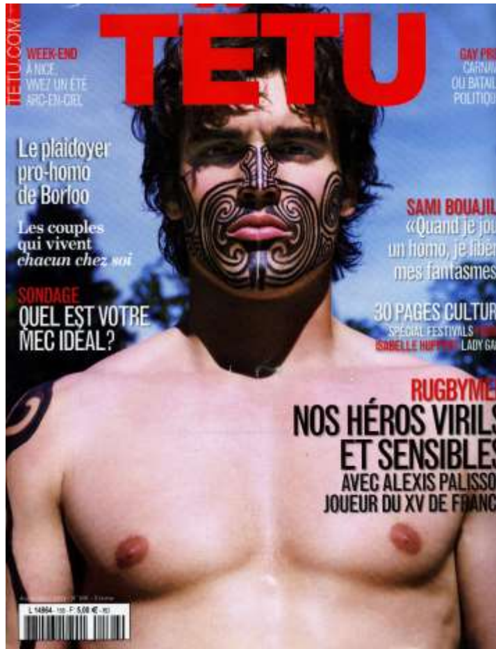
Cover of French magazine 'Têtu'