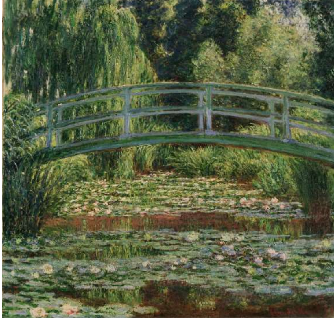
Claude Monet, The Japanese Footbridge and the Water Lily Pool, 1899