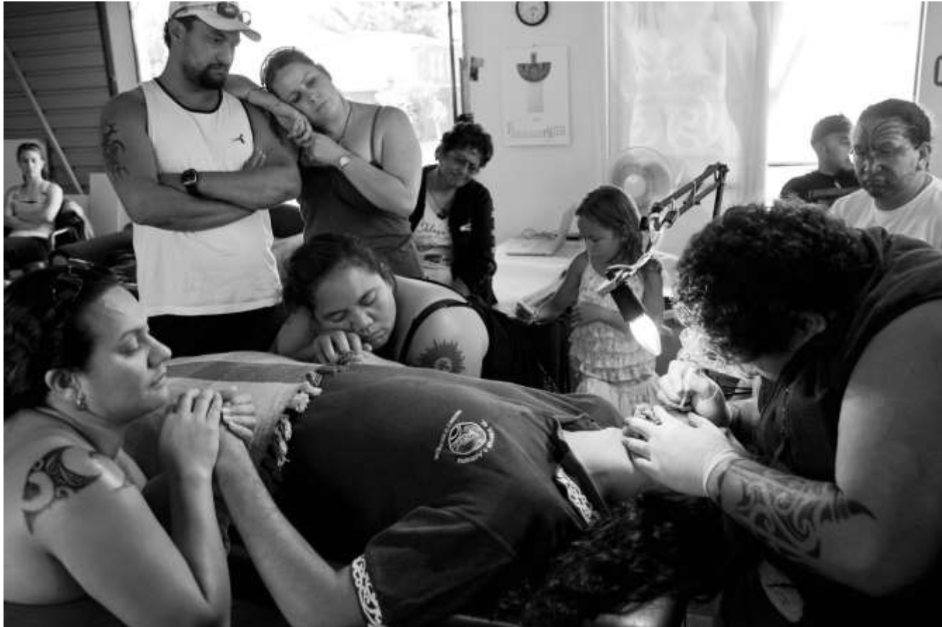
Aaron Smale, Tā Moko: Libraries on the skin, 2008