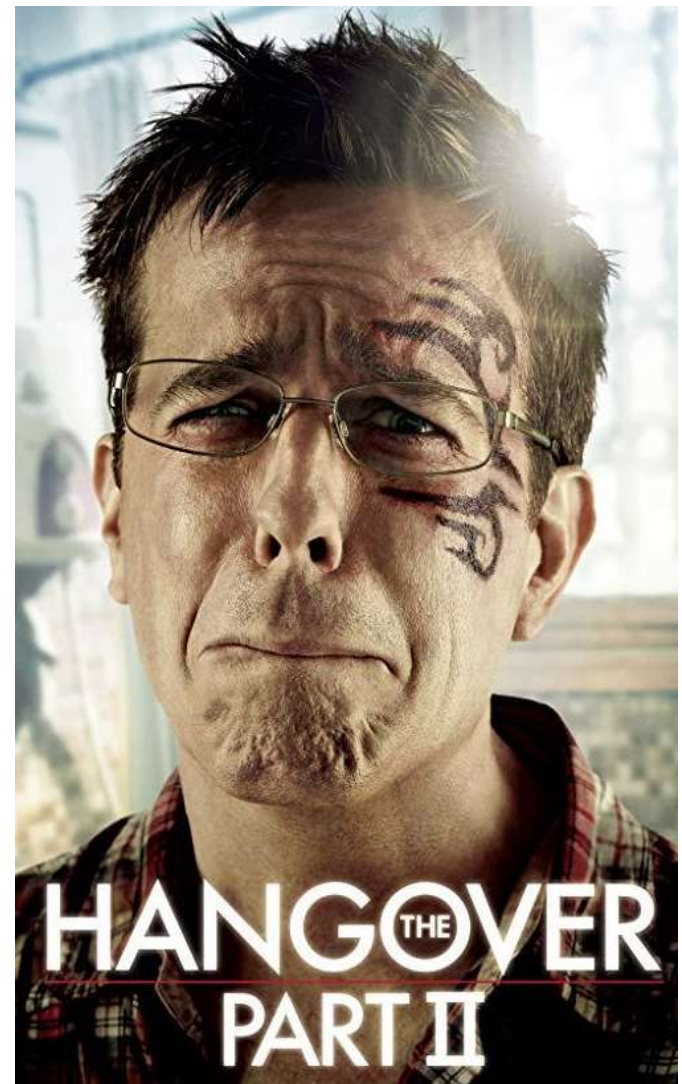
Poster for The Hangover Part II